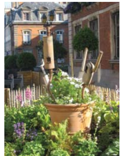
Looking after "pot plants" can be exhausting

Over the past few years a number of attempts have been made to clear the main square of cars, such as erecting bollards – inflicting parking fines – towing cars away etc., so that the area could be used for social and other events such as “Farmers’ Markets – Christmas markets – Flower and Plant Markets”, etc. All of which are under the control of THE PARKS SERVICE. However, the old market square during the summer turned into a ‘CAR PARK’ (with plants and grass) as my photographs show. The old and relic cars (and a few bikes) are being used as ‘found art’ objects, urban sculptures and jardinières.