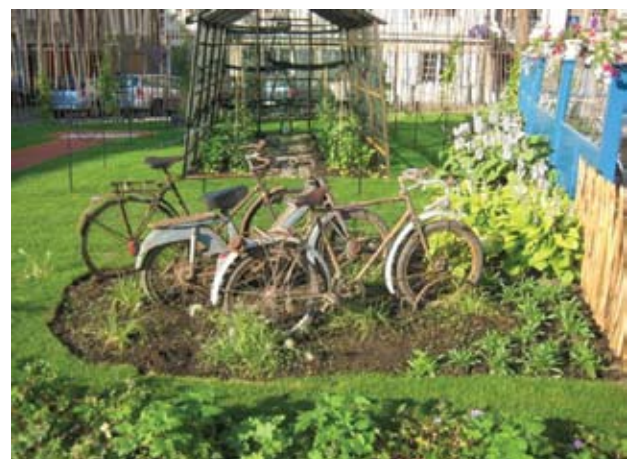
A tribute to Jacque Tati in the film La Post