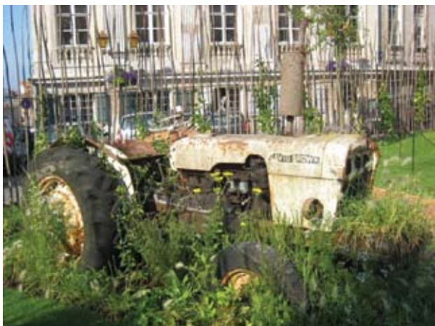
At least farmyard horses don't go rusty