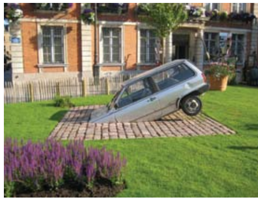
That's no way to park a car