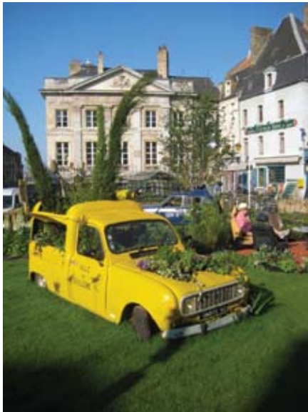
Try never to call an ambulance